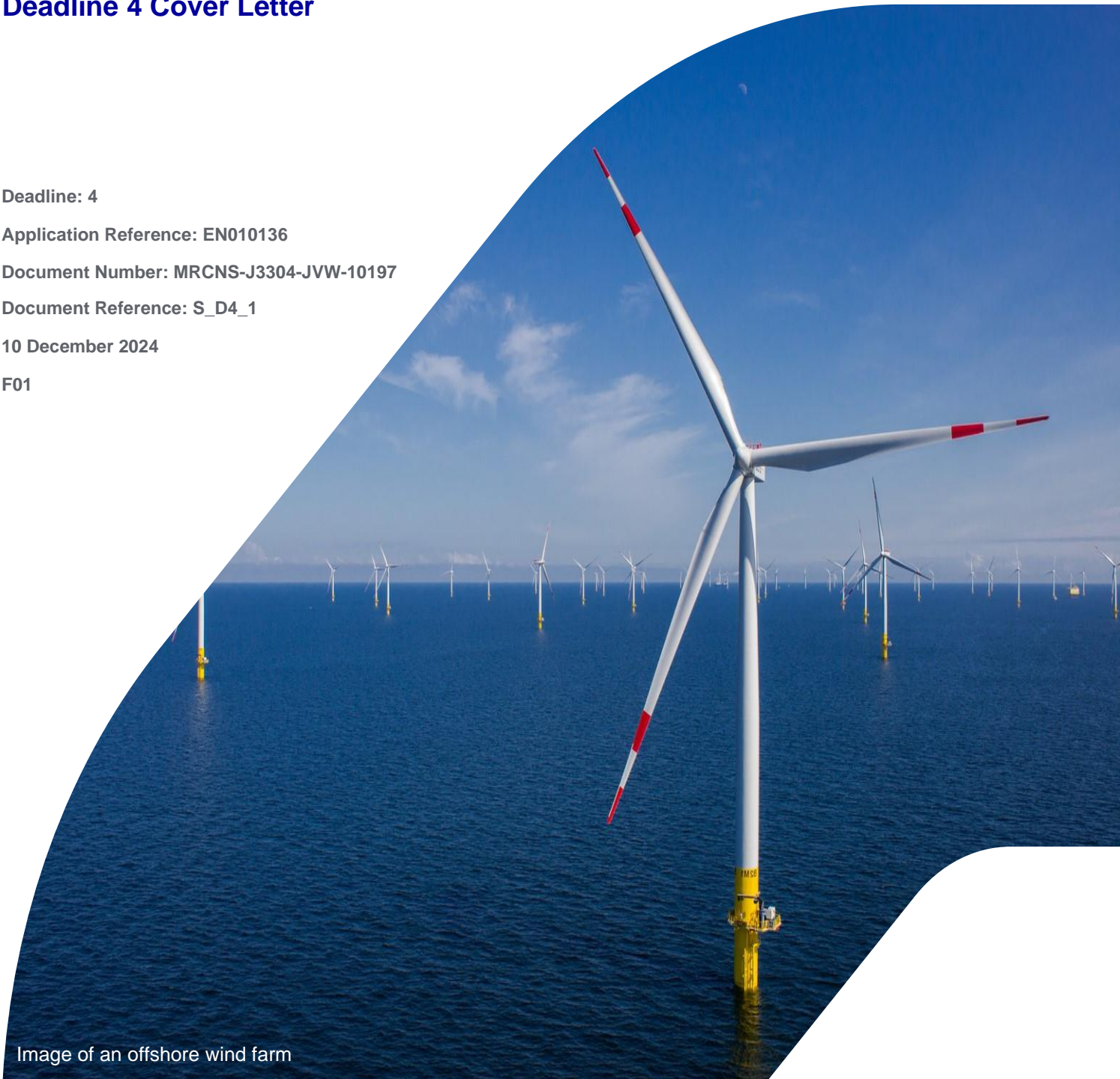
Image of an offshore wind farm